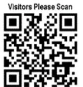
Visitors Please Scan On Line Visitor Registration Form