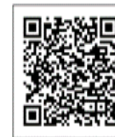
Scan to Donate to Memorial UMC